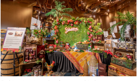
"...this win-win style of partnership between charities and business is the wave of the future, and The Cure Starts Now is certainly on the cutting edge..."